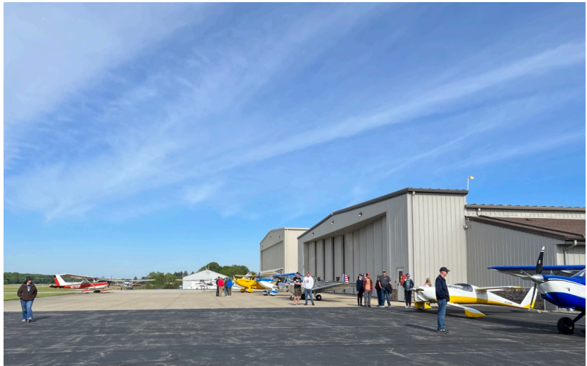
Some of the planes at our May 27 Breakfast