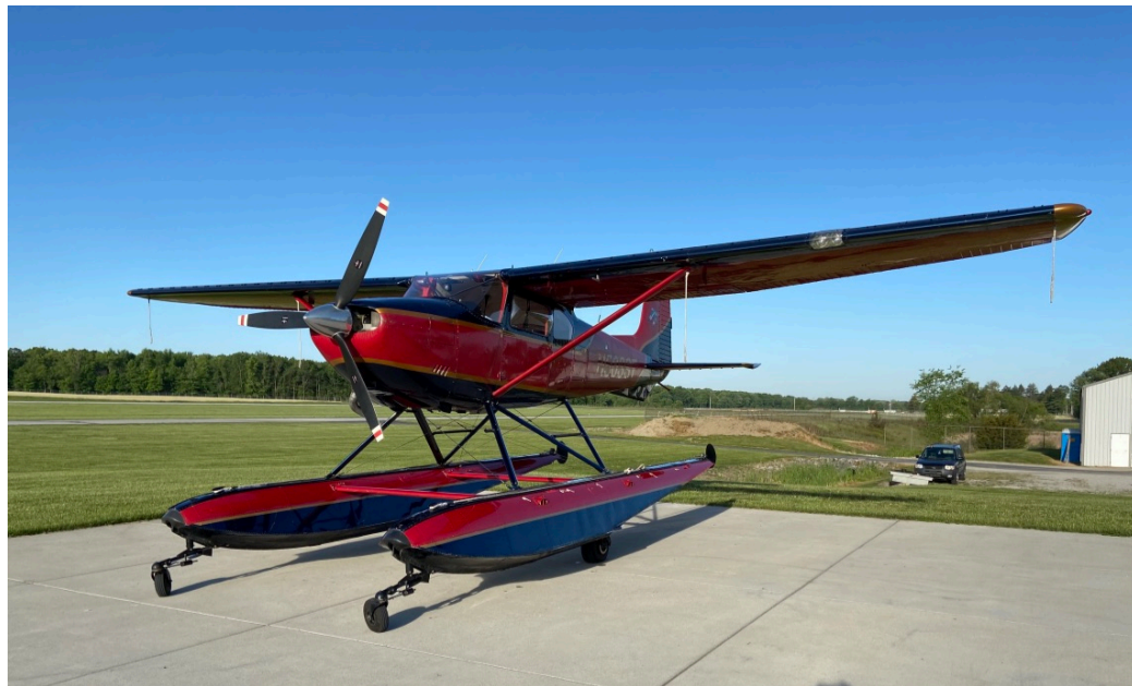
Just one of the planes that was flown in for our Breakfast.

Our address is: EAA Vintage Chapter 37 2616 County Road 60, Box 9 Auburn, IN 46706